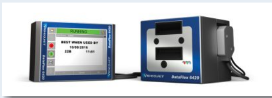
THERMAL TRANSFER PRINTER